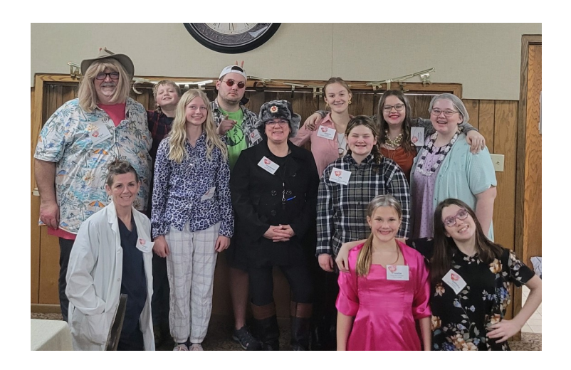
Murder Mystery Night Characters

The Easter flowers that beautify our sanctuary this Easter Sunday, are given in honor and memory of the following