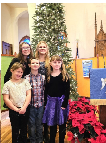
LYO Fundraiser at crooked Lane Farm