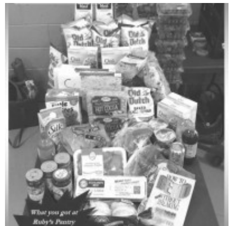
An example of the large ration of food that each family receives with a $20 donation at Ruby’s Pantry.

Inspiration Church is located at 1130 N Main Street in Breckenridge.